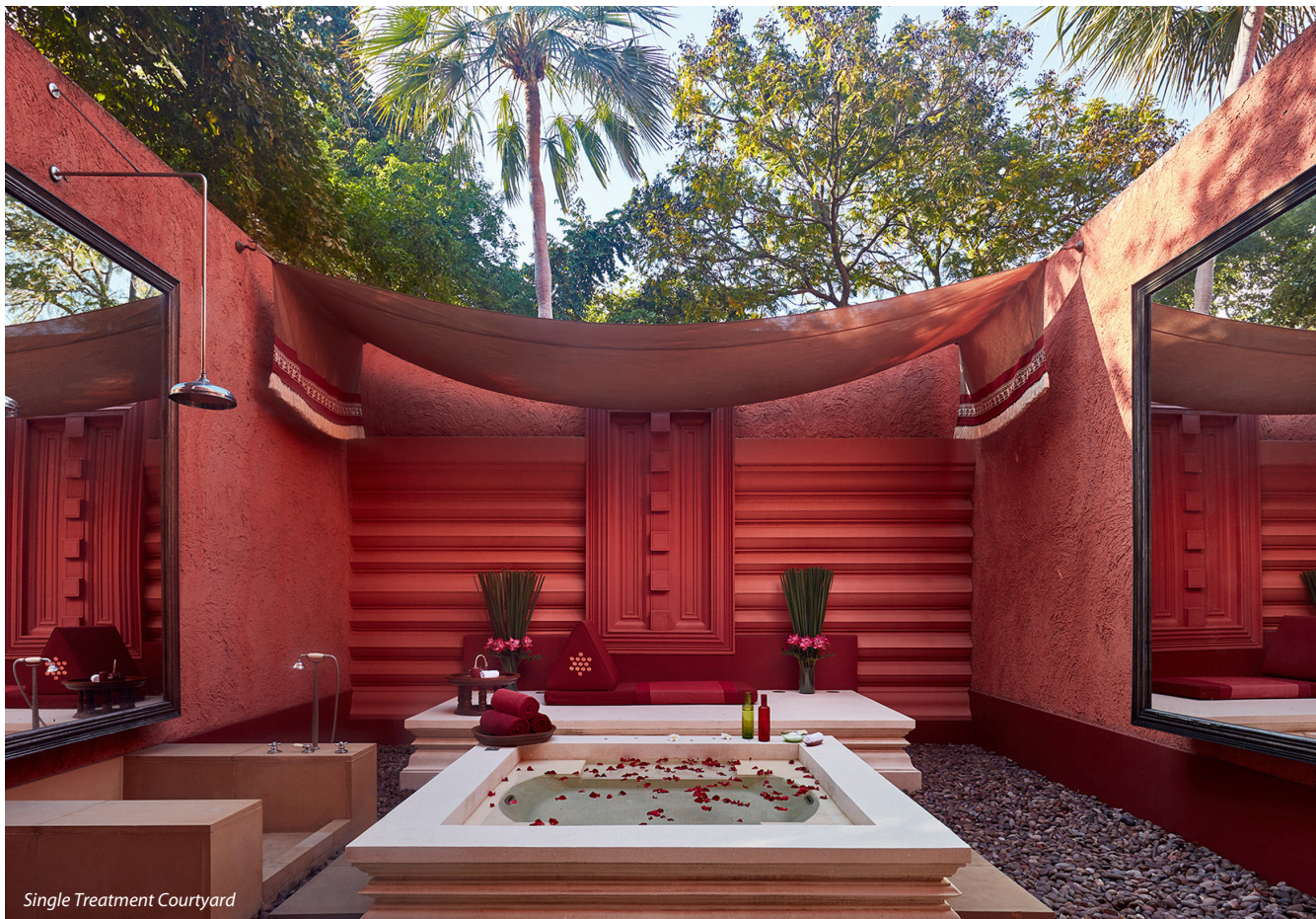
Single Treatment Courtyard