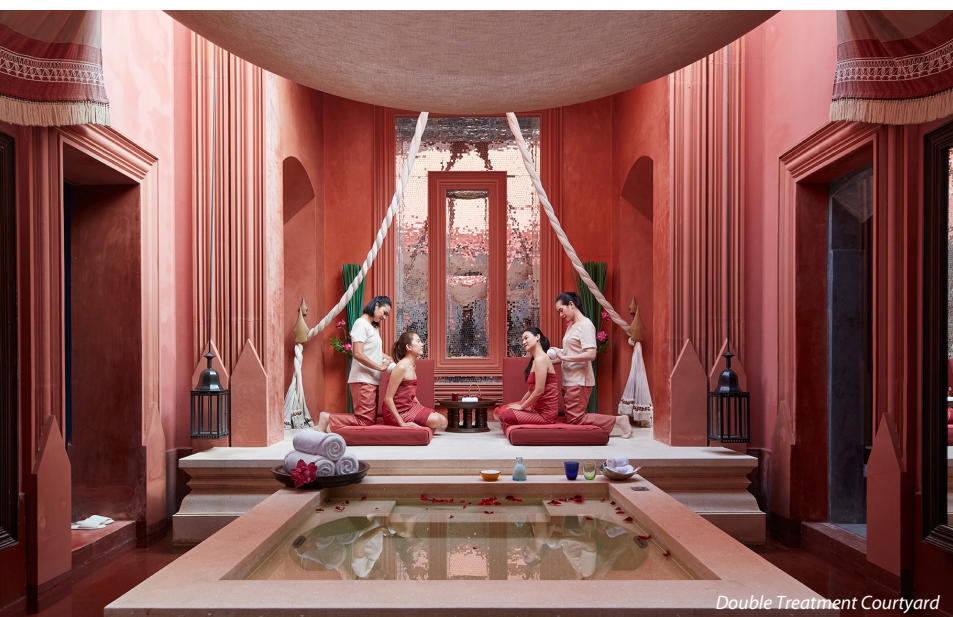
Double Treatment Courtyard

If Hua Hin is the new spa galaxy, The Barai is by far the brightest constellation.